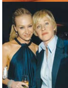
ABOVE: orange gold tones on the furnishings created a cosy ambience. LEFT: Portia De Rossi with her partner Ellen DeGeneres.