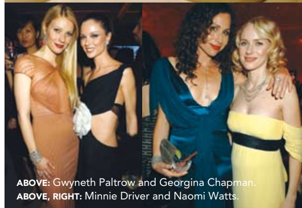
ABOVE: Gwyneth Paltrow and Georgina Chapman. ABOVE, RIGHT: Minnie Driver and Naomi Watts.

King Furniture is one Australian-born success story: what's your impression of Australian style? Interiors in particular are way ahead of the rest of the world. There's something effortless about Australian style. There's a simplicity and at the same time a lot of character.