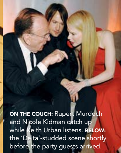
ON THE COUCH: Rupert Murdoch and Nicole Kidman catch up while Keith Urban listens. BELOW: the 'Delta'-studded scene shortly before the party guests arrived.